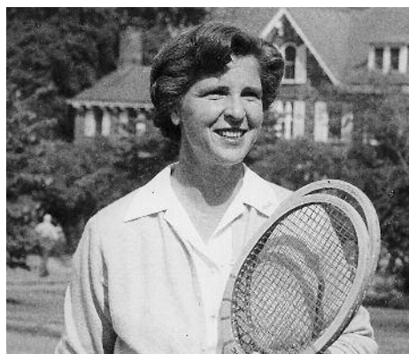
Margaret Osborne duPont